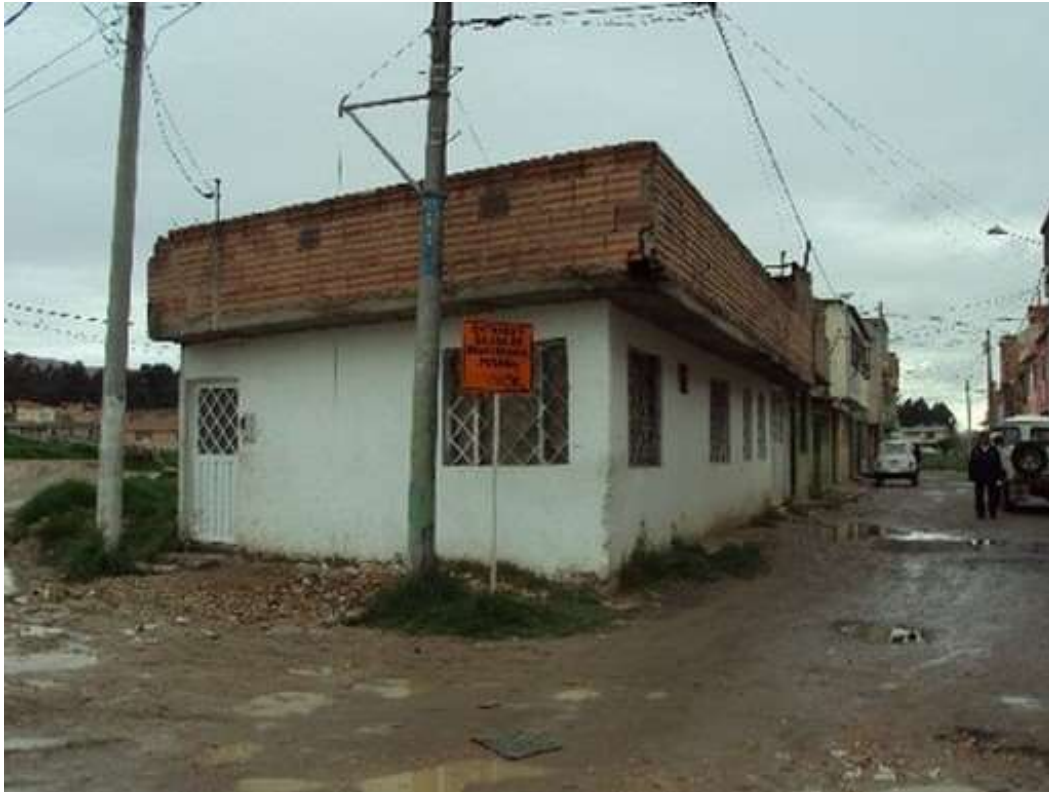
Picture 3. A poor neighborhood in Bogotá

I feel that the U.S. has something to learn from the example of countries such as Colombia. We seem to have forgotten the course of our own development, from a country with extreme poverty and inequality to one with a large middle class and, until the last decades, diminishing inequality and poverty. When Americans nostalgically look back to a better era, often it is the 1950s and 60s. The economy was strong, unemployment was low, foreign competition was weak, and there was a perception of boundless opportunities and certainly a feeling that you could have a better life than your parents and grandparents. This was the time of the 'Great Compression', a period when income inequality was at an all-time low in US history. This period extended through the early 1980s. See Figure 2 , below.