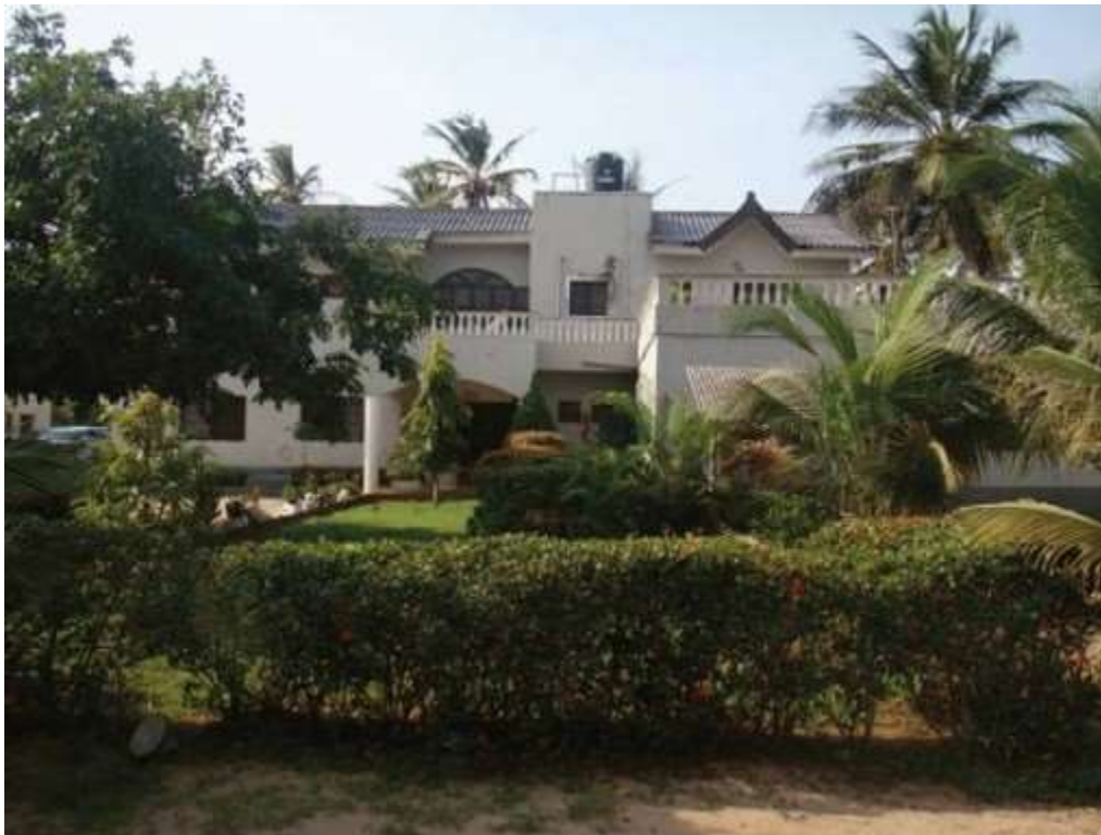
Picture 1. A wealthy neighborhood in Lagos

The United States is a country of great wealth. But there's nothing unique about the phenomenon of wealth and its associated beautiful neighborhoods, excellent schools and high quality of life. Nearly every country and major city in the world exhibit these phenomena to some extent. Even generally unpleasant places I've come to know, such as Lagos, Nigeria, have islands of extreme wealth and privilege. See Picture 1 above. What is, on the contrary, relatively unusual are