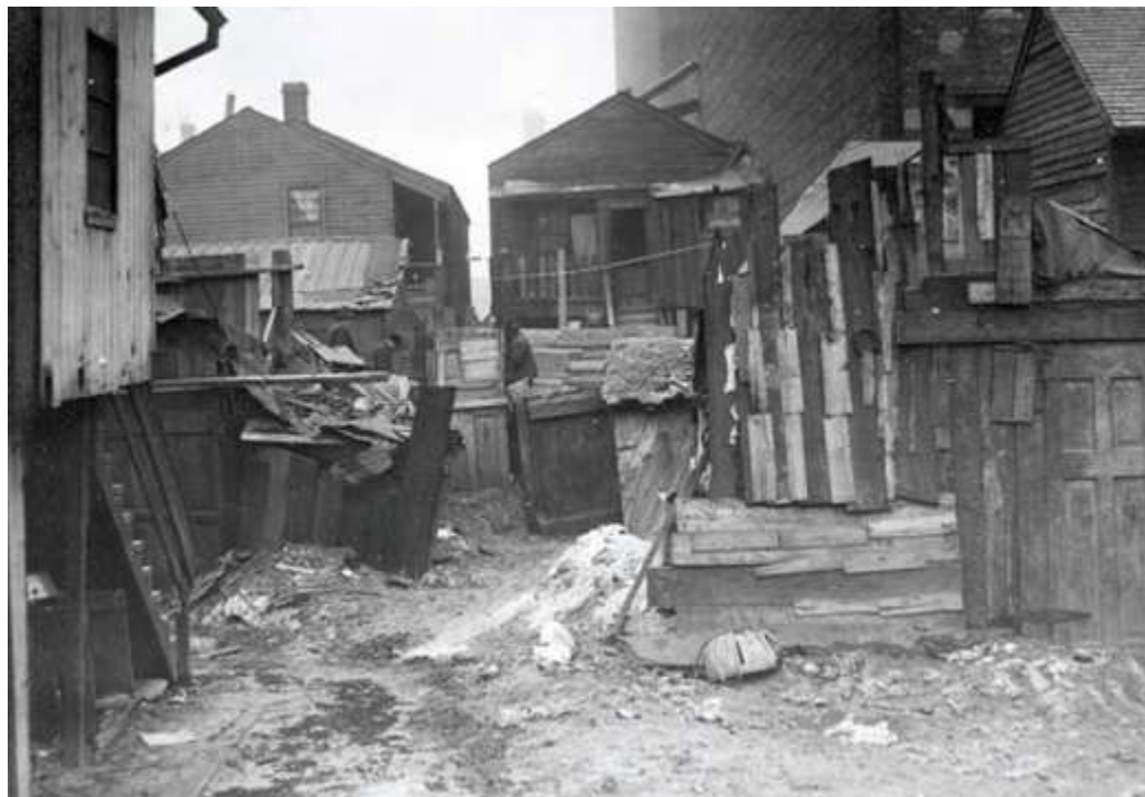
Picture 4. A New York Slum of the early 20 th Century

A return to high-level inequality explains some of the parallels between the United States and Latin American societies today. As I've written above, both the U.S. and Latin America have strikingly high homicide rates, high levels of incarceration (the U.S. leads the world), low social cohesion among differing groups (socioeconomic, religious, racial, political, etc), a lack of trust in public institutions, low high school graduation rates, inaccessibility for many to higher education, and a perception among some groups that respect can't be earned without recourse to violence.