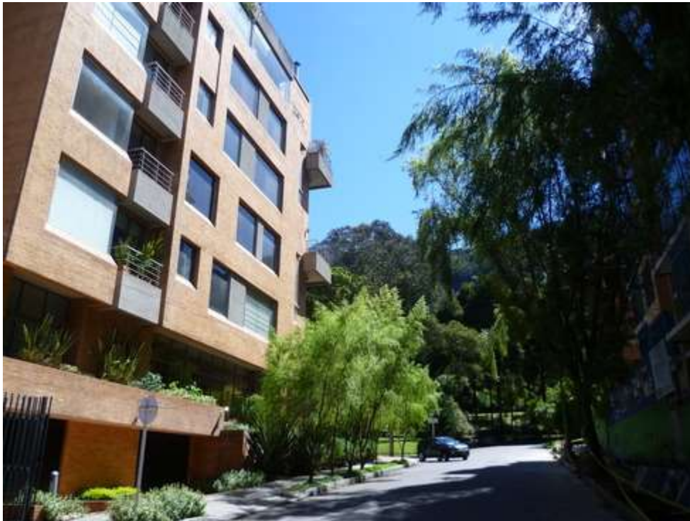
Picture 2. A wealthy neighborhood in Bogotá

And not only is the abundance impressive. So too are the opportunities for those at the top. If you are from a wealthy family in Bogotá, odds are that you have an excellent education, high-quality medical and dental care, a network of influential connections - and an excellent job paying a rich world salary with a social and cultural life to match. You will be missing little that your wealthy peers in Europe