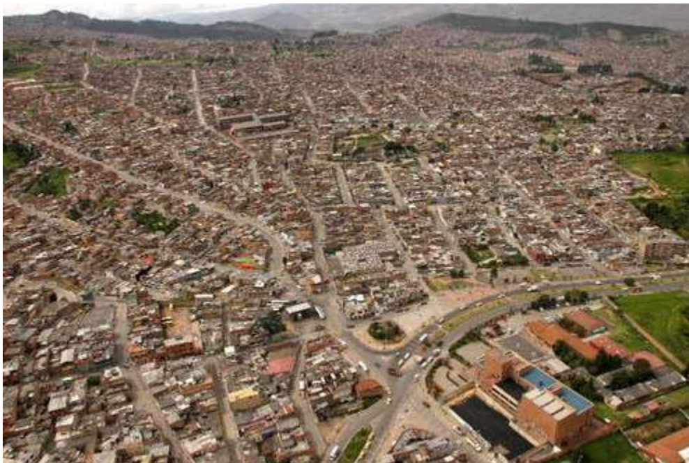
Picture 5. The Poor Socha District of Bogota.

There is a lot of research establishing the negative consequences resulting from a lack of trees and green space in a neighborhood, ranging from the physical (more polluted air and a stronger heat island effect to the psychological (lower general sense of well being and more stress). Green in public spaces is one example of a common human need that is often not being met in grossly unequal societies - just like good public schools and security. Efforts to address gross inequality can start with initiatives to re-balance public goods, to make the experience of walking down a street in Soacha (see Picture 5 , above) feel not so utterly different from the experience of walking down the street in Chico (a wealthy neighborhood of Bogotá), or being in a public school in the south Bronx not so different from attending a public school in Westchester County (a wealthy suburban area of New York).